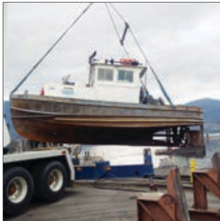
This tug boat was one of the boats involved in helping bring the Pendozi over to the Westside.