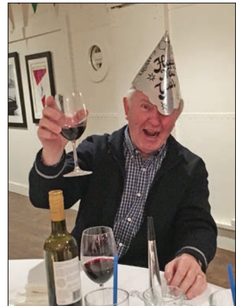
Always fun to be had at the West Kelowna Yacht Club!