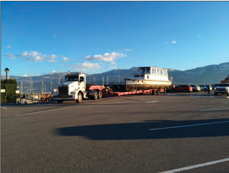
There she goes!