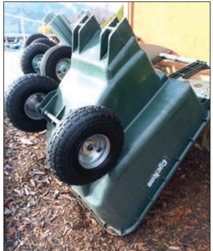
All the carts have been reconditioned with nice rubber tires. If you see any problems with these tires, please let the club know.

Club Access to Washrooms is available from 7:00am to 11:00pm.